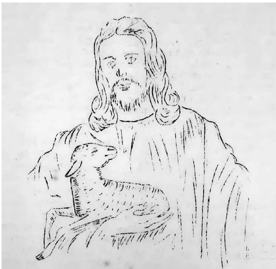
Fig. 3: Inmate sketch of Jesus Christ holding a lost sheep symbolic of AA adherents. Realidad , 1:3 (September-November 1956), p. 11.

and La Última Copa . V.M.C. anticipated “confronting reality, no matter how cruel [or] harsh,” to flaunt the “universal love” of the Almighty regardless of class, race, or religion. 111 At the core of this love were “cooperativism” and “mutual aid,” two elements for “a better world.” 112