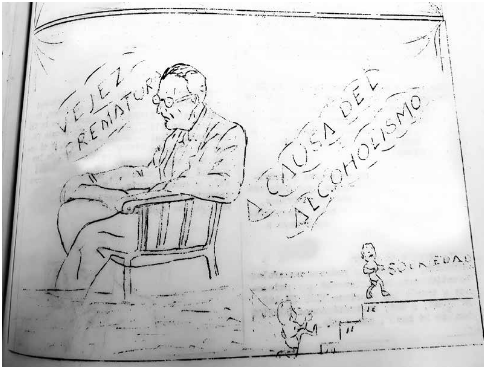
Fig. 2: Inmate sketch of the impact of alcoholism on aging. Realidad , 2:4 (December 1957-February 1958), p. 15.

well. A sketch from the December 1957 edition of Realidad (Fig. 2) depicts the physiological fallout of alcoholism—premature aging—represented by a seated, balding, senile man, and contrasts it to sobriety, depicted as an energetic child or toddler.